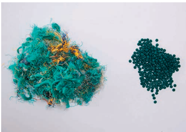
Fig. 2. Mechanical recycling turns the maritime waste back into high-quality plastic granulate

Plastix purchases its plastic waste from ports, netmakers and plastic waste disposal companies worldwide. The in-house laboratory analyses, evaluates and records the recyclability of all incoming input waste streams based on their physical and chemical properties. Plastix cur-