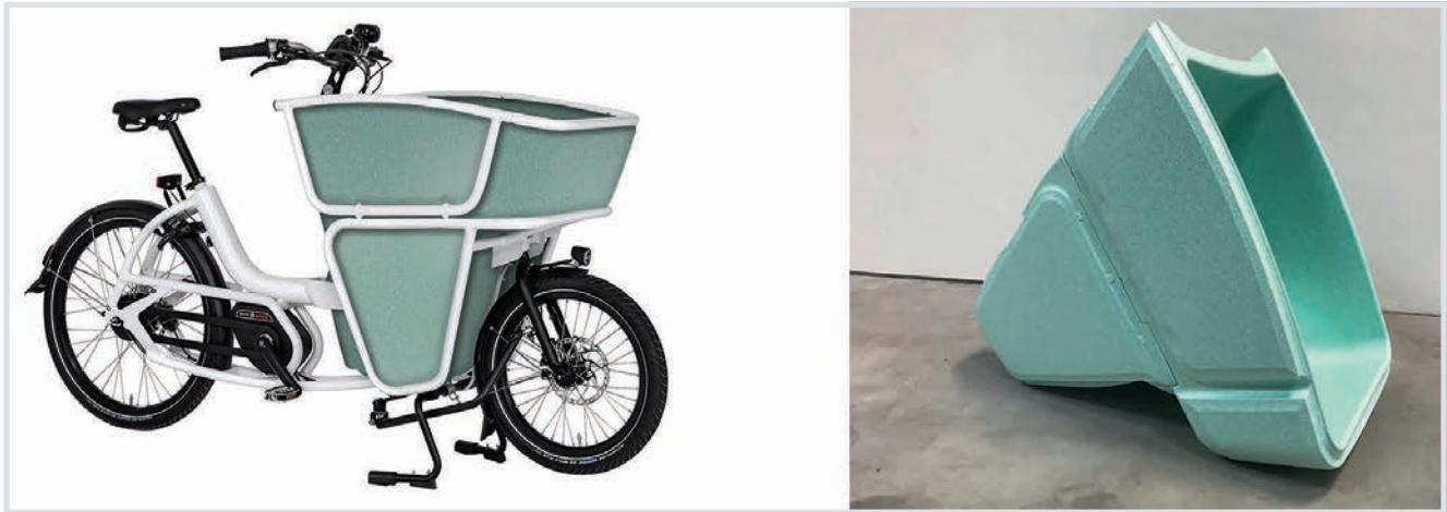
Fig. 4. Feasibility study for the Urban Arrow Shorty cargo bicycle: the transport container was made entirely from Arpro 35 Ocean particle foam