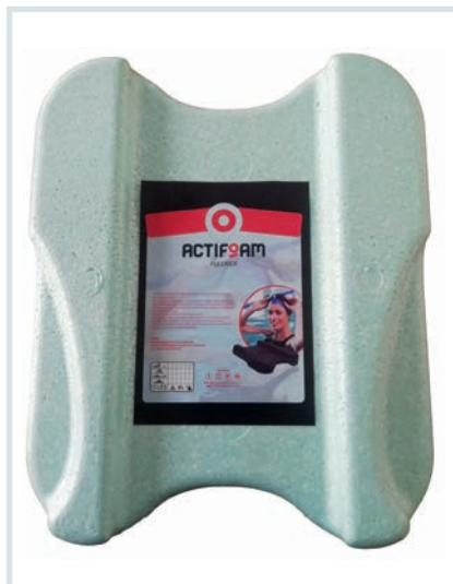
Fig. 6. Atermit is bringing Arpro 35 Ocean back into the water in the form of a buoyancy aid for athletes