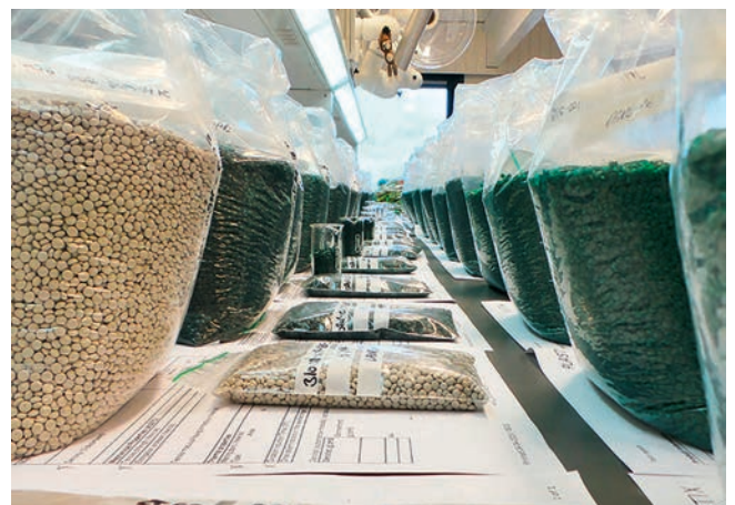
Fig. 3. Before delivery, the recyclates are analyzed and subjected to quality control