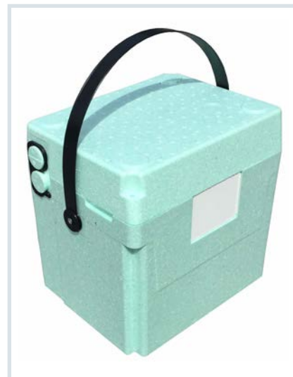
Fig. 7. Artekno uses the EPP Arpro 35 Ocean © Artekno