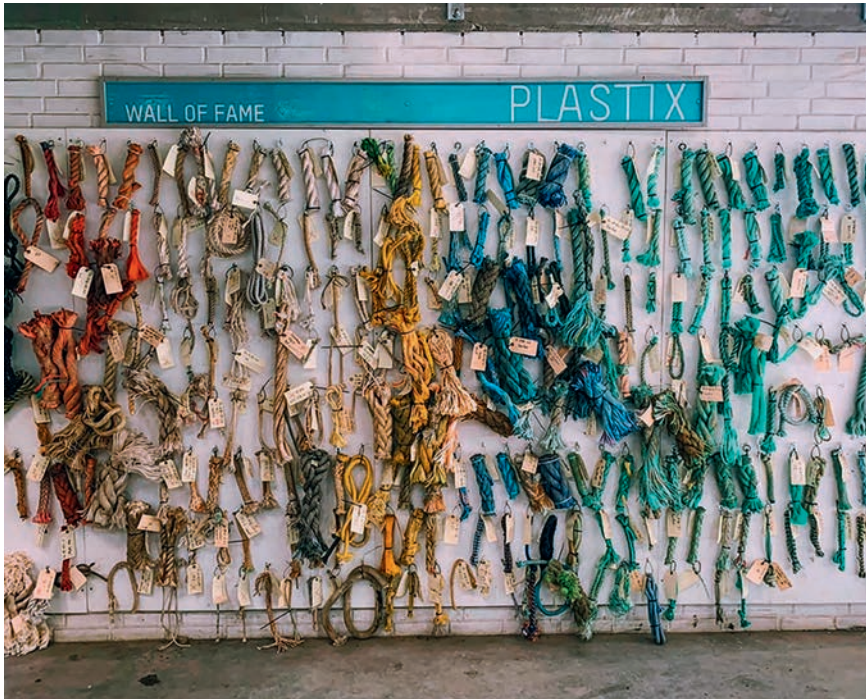
Fig. 1. Over 900 different types of nets and ropes are stored in the Plastix database. The “Wall of Fame” of the company shows an extract

landfill and incineration. Both types have significant negative impacts on climate, wildlife and human health. The establishment of a functioning closed-loop economy and the recycling of plastic waste into high-quality, reprocessed raw materials have therefore become global megatrends. The governments of various countries and international organizations such as the EU and the United Nations are addressing the waste problem, for example, through political and organizational commitments aimed at greater climate protection and responsible consumption of raw materials. Both have been incorporated